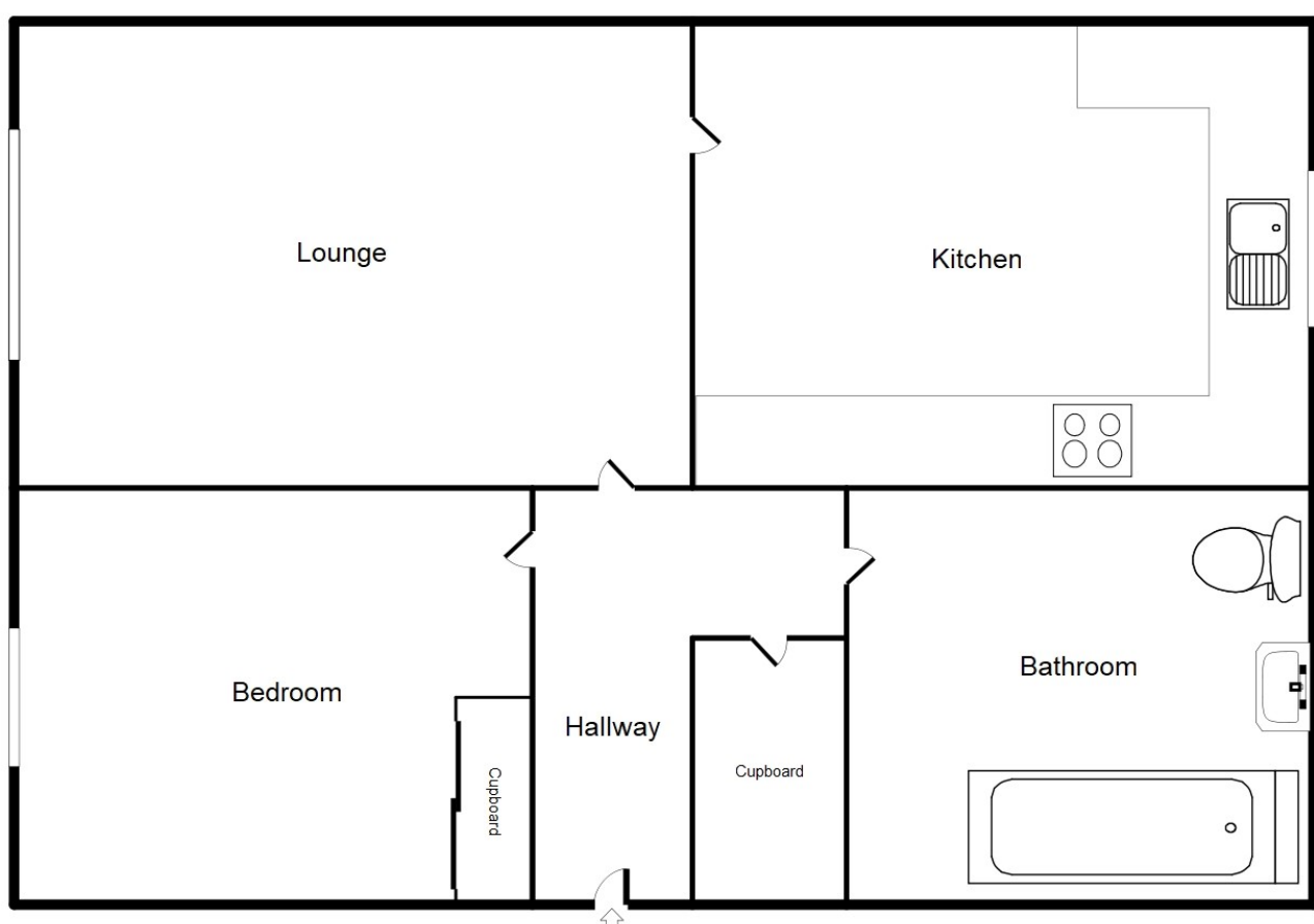
Please note this floorplan is not to scale and is for representational purposes only