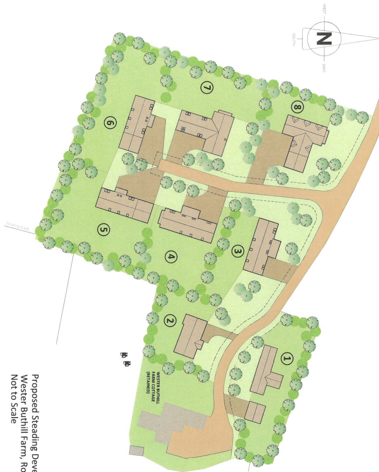
Proposed Steading Development at Wester Buthill Farm, Roseisle, Moray Not to Scale