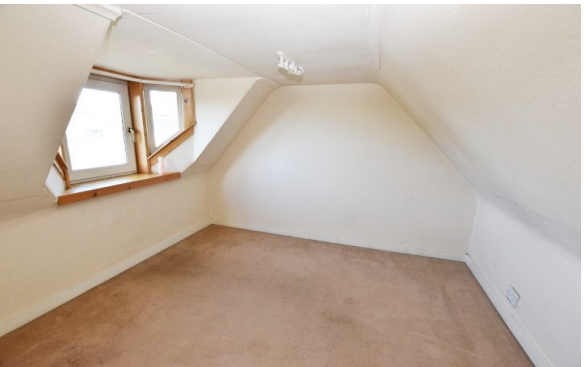
This delightful house would make a lovely family home.