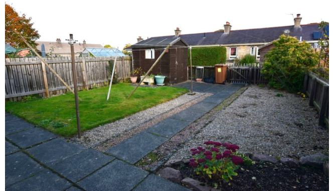
3 Roysvale Place, Forres